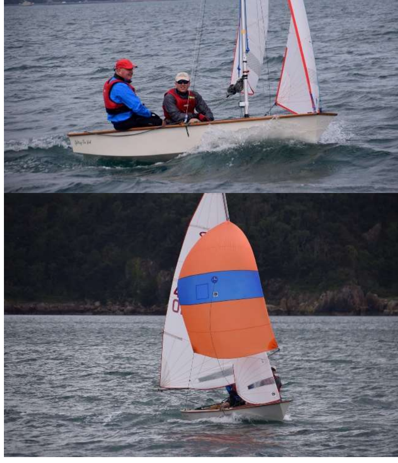
Aug-2023 Nationals at Brixham YC

Miracle 4110 15<sup>th</sup> October 2023